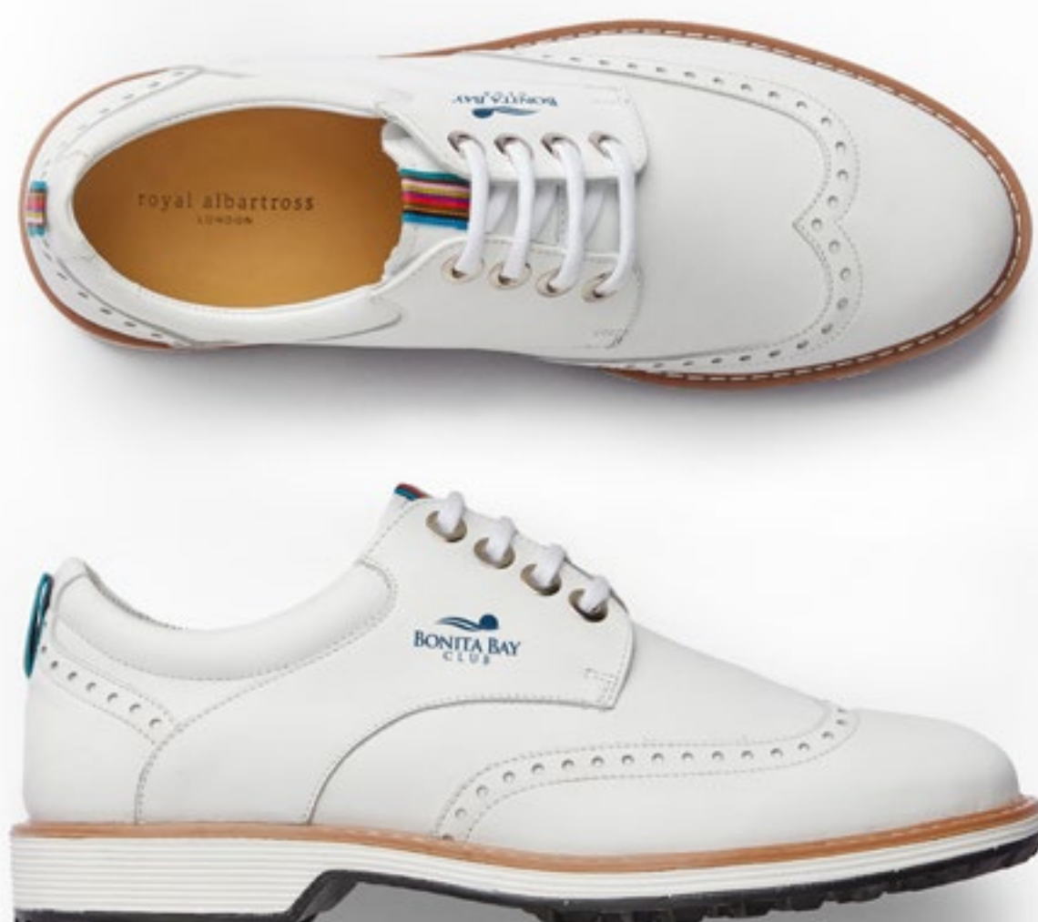
MEN'S CUSTOM SHOE