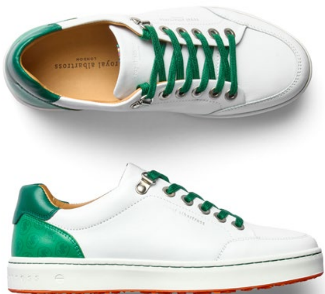
WOMEN'S CUSTOM SHOE