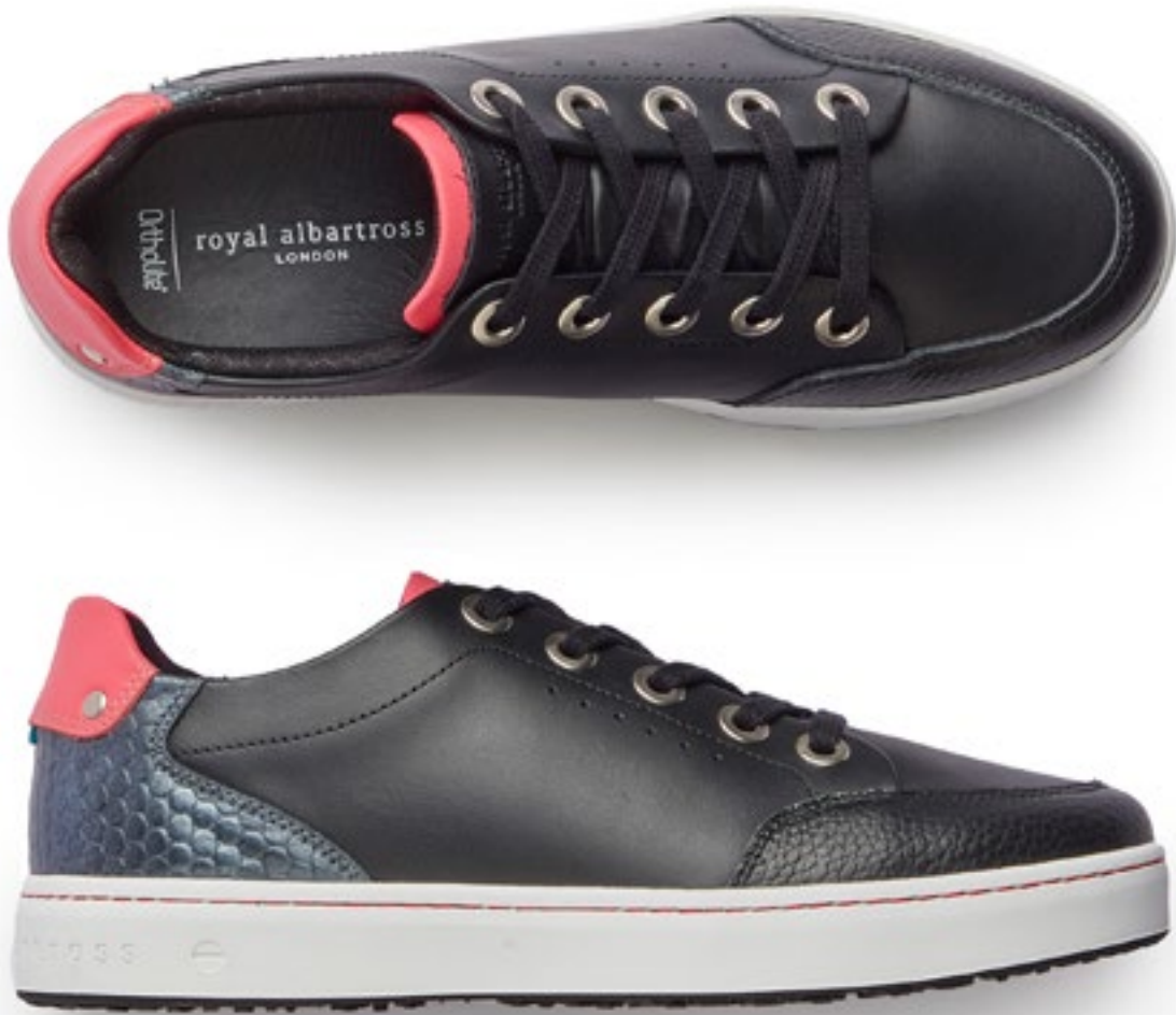
BLACK PEARL AVAILABLE MARCH 2025