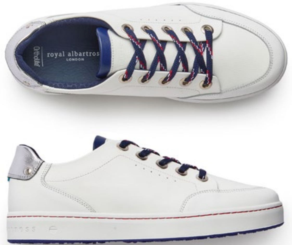
HOUNDSTOOTH AVAILABLE MARCH 2025