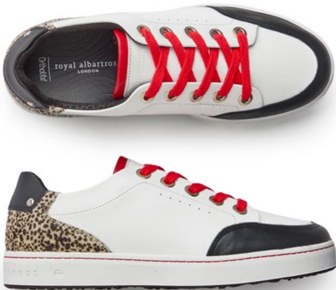
WILD AVAILABLE APRIL 2025