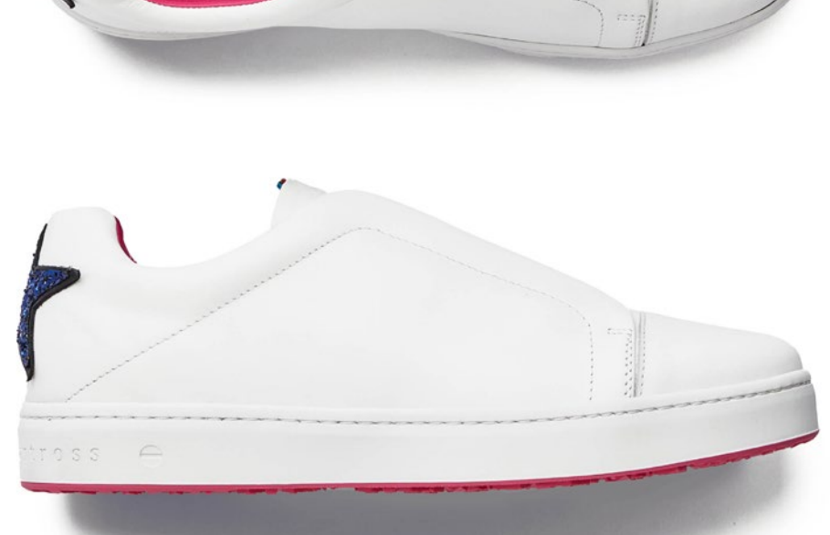
HEARTS AVAILABLE MARCH 2025