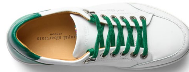
WOMEN'S CUSTOM SHOE