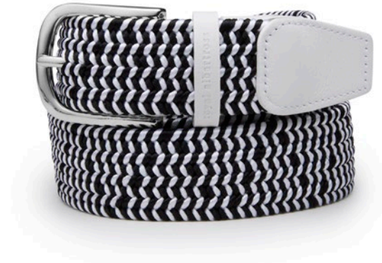
NAVY | PINK