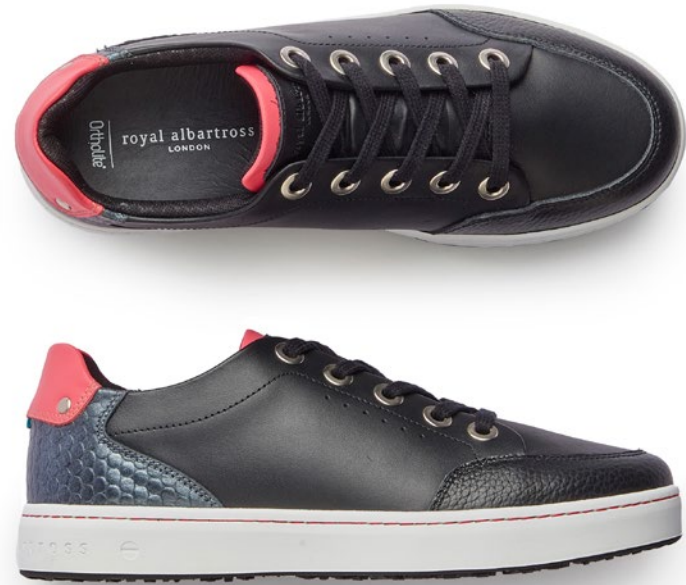
BLACK PEARL AVAILABLE MARCH 2025