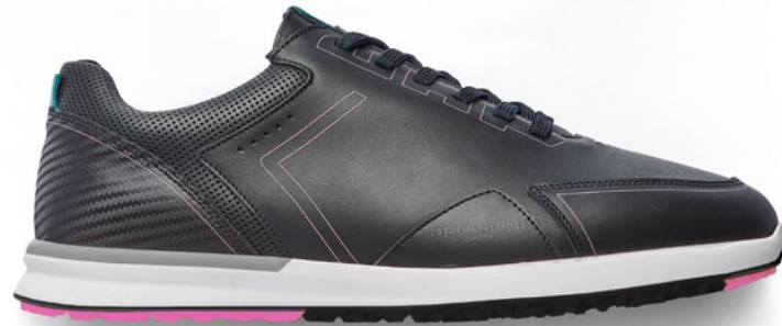
OOH LA_LA AVAILABLE APRIL 2025