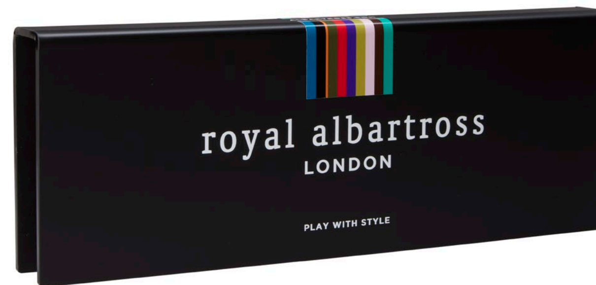
RA BRAND BLOCK SIZE: 15.75"(W) x 5.9"(H) x 1.9"(D)