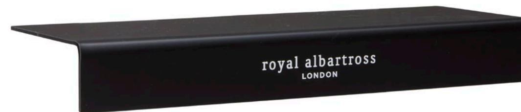
RA SLAT WALL SHELF SIZE: 11.8"(W) x 1.1"(H) x 4.3"(D)

Below are a few POS items available to support your buy in-store