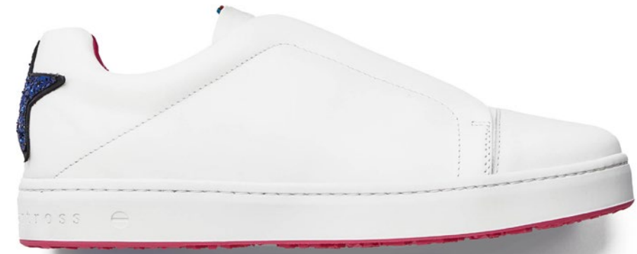
HEARTS AVAILABLE MARCH 2025