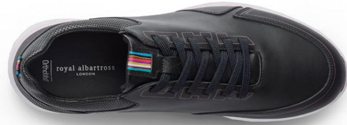
BLACK | PINK AVAILABLE JUNE 2025