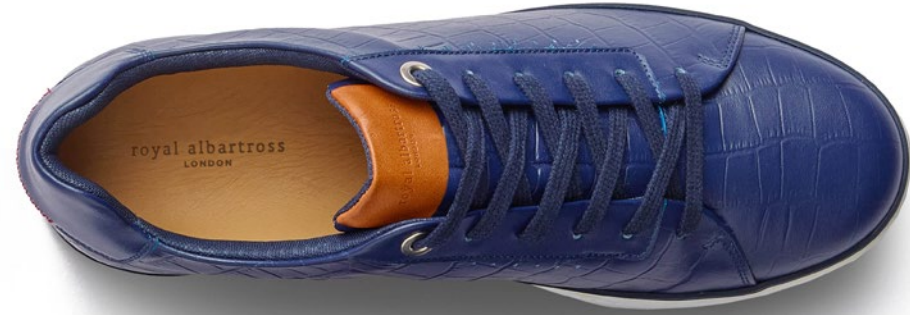
NAVY CROC AVAILABLE MARCH 2025