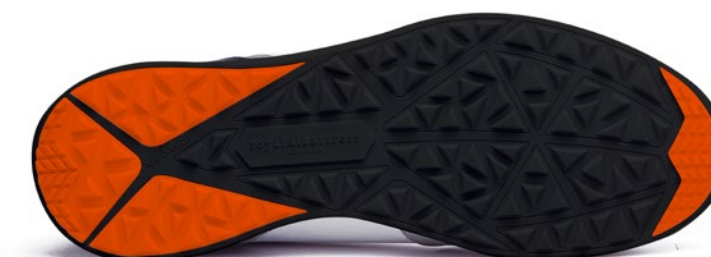
PUREFORM SOLE TECHNOLOGY