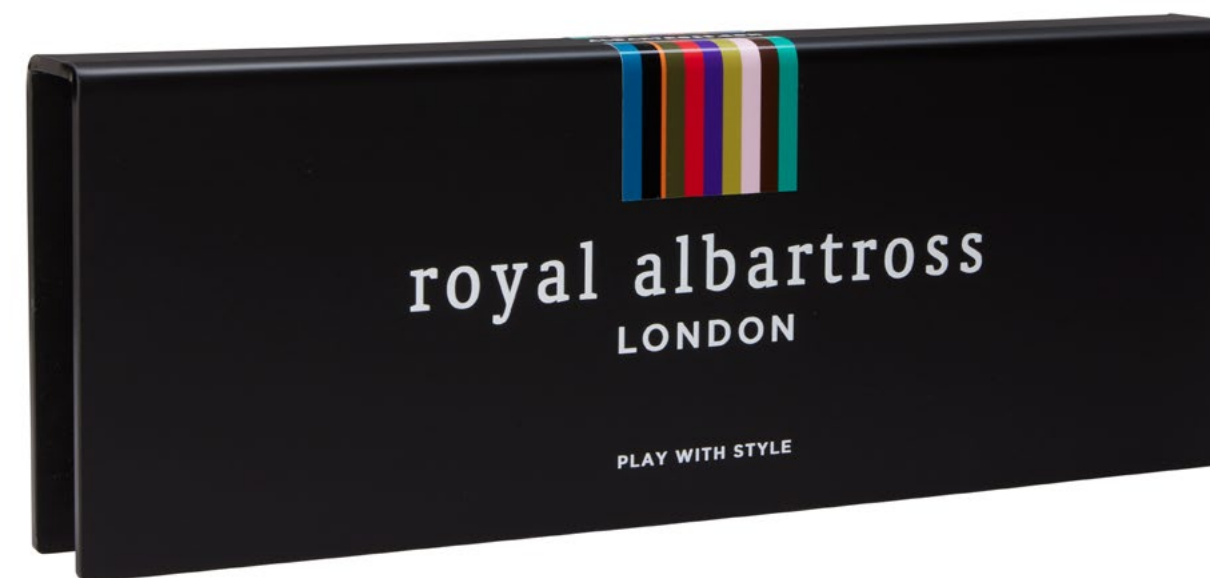
RA BRAND BLOCK SIZE: 15.75"(W) x 5.9"(H) x 1.9"(D)