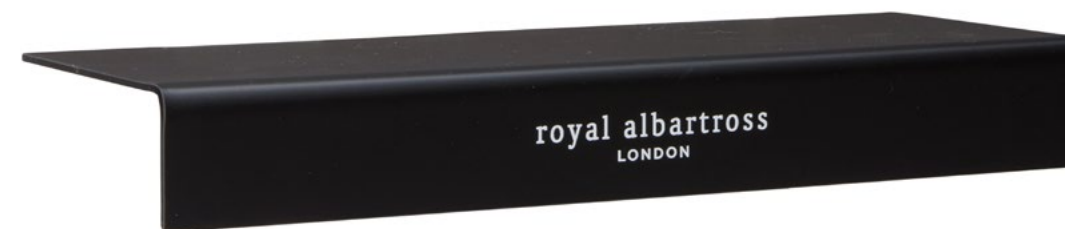
RA SLAT WALL SHELF SIZE: 11.8"(W) x 1.1"(H) x 4.3"(D)

Below are a few POS items available to support your buy in-store