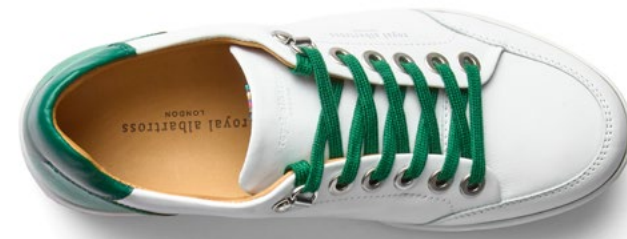
WOMEN'S CUSTOM SHOE