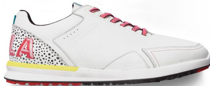
PUREFORM SOLE TECHNOLOGY