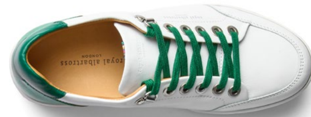
WOMEN'S CUSTOM SHOE