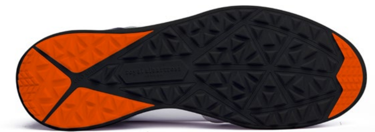
PUREFORM SOLE TECHNOLOGY