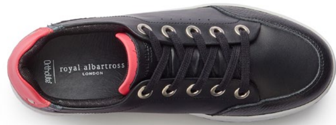
BLACK PEARL AVAILABLE DECEMBER 2024